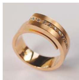
R-4284/10 Spiralingring Gg 750 10 Brill. TWvs 0.15ct B: 6.6mm