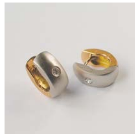
O-5251/1 Ohringe Pt 950 Gg 750 2 Brill. TWvs 0.08ct B: 5.3mm / L: 12.0mm