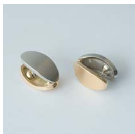
O-5435 Ohringe Pt 950/- + Gg 750/- B: 8.7mm / L: 17.3mm