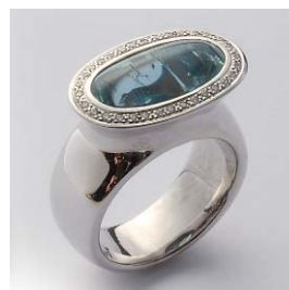
R-4421/32 wg Ring Wg 750/- 32 Brill. TWvs 0.25ct Aquamarin 5ct