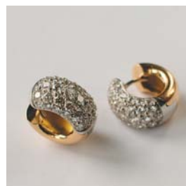
O-5291/31 Ohringe Pt 950 Gg 750 62 Brill. TWvs 1.15ct B: 6.9mm / Aø: 13.3mm