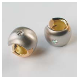
O-5349/1 Ohrringe Pt 950 Gg 750 2 Brill. TWvs 0.14ct B: 10.5mm / Aø 13.0mm