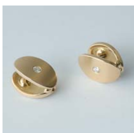
O-5432/1 Ohringe Gg 750/- 2 Brill. TWvs 0.20ct B: 11.3mm / L: 17.1mm