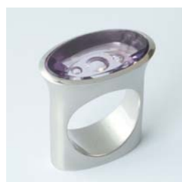
R-4347 Ring Pd 950/- Amethyst 15.27ct