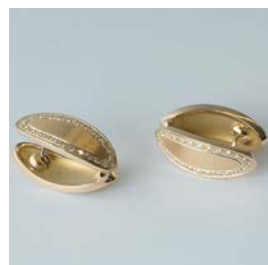
O-5436/24 Ohringe Gg 750/- 48 Brill. TWvs 0.42ct B: 9.3mm / L: 20.7mm