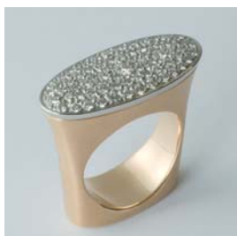
R-4452/67 Ring Gg 750/- + Pt 950/- 67 Brill. TWvs 1.35ct