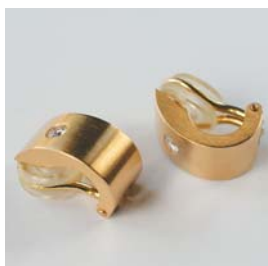
O-5162/1 Ohrclipse Gg 750 2 Brill. TWvs 0.11ct B: 7.0mm / L: 9.2mm