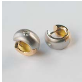
O-5353/1 Ohrringe Pt 950 Gg 750 2 Brill. TWvs 0.10ct B: 6.5mm / Aø 11.8mm