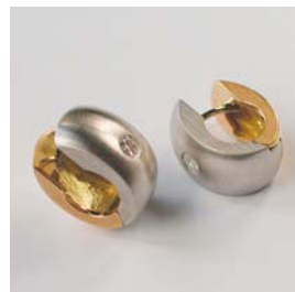
O-5211/1 Ohringe Pt 950 Gg 750 2 Brill. TWvs 0.14ct B: 8.7mm / L: 13.6mm