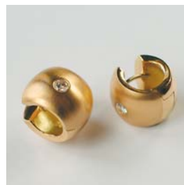
O-5348/1 Ohringe Gg 750 2 Brill. TWvs 0.14ct B: 10.5mm / Aø 13.0mm