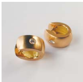
O-5212/1 Ohringe Gg 750 2 Brill. TWvs 0.11ct B: 6.8mm / L: 13.3mm