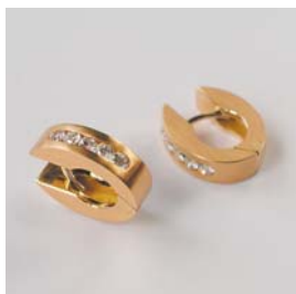
O-5156/5 Ohringe Gg 750 10 Brill. TWvs 0.40ct B: 4.3mm / L: 14.4mm