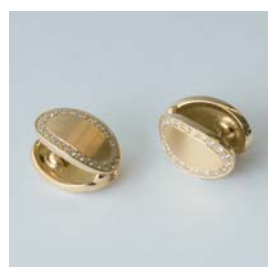
O-5432/22 Ohringe Gg 750/- 44 Brill. TWvs 0.40ct B: 11.3mm / L: 17.1mm