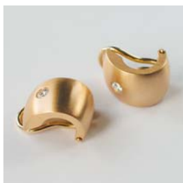
O-5252/1 Ohrclipse Gg 750 2 Brill. TWvs 0.13ct B: 9.0mm / L: 14.0mm