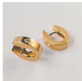
O-5062/1 Ohringe Gg 750 2 Brill. TWvs 0.08ct B: 3.8mm / L: 13.5mm