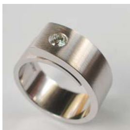
R-4283/1 Spiralring Wg 750 1 Brill. TWvs 0.17ct B: 8.5mm