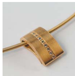
C-2029/10 Anhänger Gg 750 10 Brill. TWvs 0.12ct B: 10.2mm / L: 17.5mm