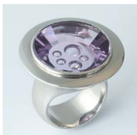
R-4433 Ring Pd 950/- Amethyst 27.90ct