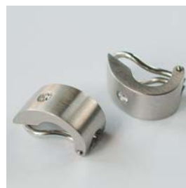
O-5163/1 Ohrclipse Pt 950 Bügel Wg 750 2 Brill. TWvs 0.11ct B: 7.0mm / L: 9.2mm