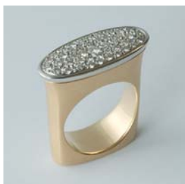
R-4451/43 Ring Gg 750/- + Pt 950/- 43 Brill. TWvs 0.78ct