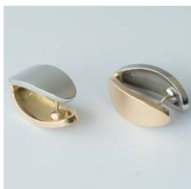
O-5437 Ohringe Pt 950/- + Gg 750/- B: 9.3mm / L: 20.7mm