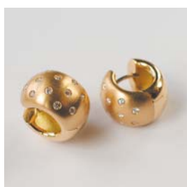
O-5292/12 Ohringe Gg 750 24 Brill. TWvs 0.22ct B: 8.9mm / Aø 13.8mm