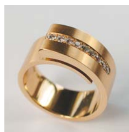
R-4283/10 Spiralingring Gg 750 10 Brill. TWvs 0.22ct B: 8.5mm