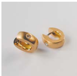
O-5248/1 Ohringe Gg 750 2 Brill. TWvs 0.07ct B: 4.3mm / L: 11.6mm