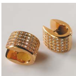
O-5294/40 Ohringe Gg 750 40 Brill. TWvs 0.75ct B: 10.0mm / L: 14.0mm