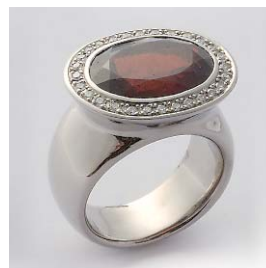
R-4429/28 wg Ring Wg 750/- 28 Brill. TWvs 0.25ct Granat fac. 9.56ct