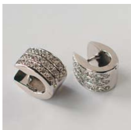
O-5310/18W Ohringe Wg 750 36 Brill. TWvs 0.50ct B: 7.5mm / L: 12.0mm