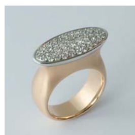
R-4450/47 Ring Gg 750/- + Pt 950/- 47 Brill. TWvs 0.70ct