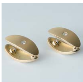
O-5436/1 Ohringe Gg 750/- 2 Brill. TWvs 0.14ct B: 9.3mm / L: 20.7mm