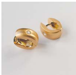
O-5250/1 Ohringe Gg 750 2 Brill. TWvs 0.08ct B: 5.3mm / L: 12.0mm