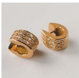
O-5310/18 Ohringe Gg 750 36 Brill. TWvs 0.50ct B: 7.5mm / L: 12.0mm