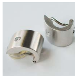
O-5165/1 Ohrclipse Pt 950 Bügel Wg 750 2 Brill. TWvs 0.14ct B: 10.0mm / L: 9.5mm