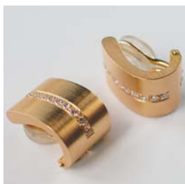
O-5340/10 Ohrclipse Gg 750 20 Brill. TWvs 0.25ct B: 10.5mm / L: 15.0mm