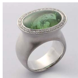
R-4425/32 wg Ring Wg 750/- 32 Brill. TWvs 0.22ct Turmalin 14ct