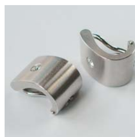
O-5340/1 Ohrclipse Wg 750 2 Brill. TWvs 0.14ct B: 10.5mm / L: 15.5mm