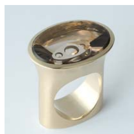
R-4346 Ring lightgold 375/- Rauchquarz 20.66ct