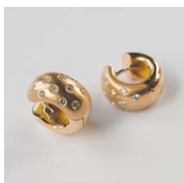
O-5290/12 Ohringe Gg 750 24 Brill. TWvs 0.22ct B: 6.7mm / Aø 13.0mm