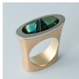
R-4452 Ring Gg 750/- + Pt 950/- Turmalin 1. Qualität 6.31ct