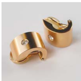
O-5164/1 Ohrclipse Gg 750 2 Brill. TWvs 0.14ct B: 10.0mm / L: 9.5mm