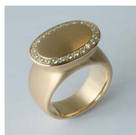
R-4438/24 Ring Gg 750/- 24 Brill. TWvs 0.24ct