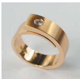
R-4284/1 Spiralring Gg 750 1 Brill. TWvs 0.10ct B: 6.6mm