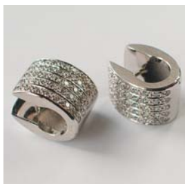
O-5294/40W Ohringe Wg 750 80 Brill. TWvs 0.75ct B: 10.0mm / L: 14.0mm