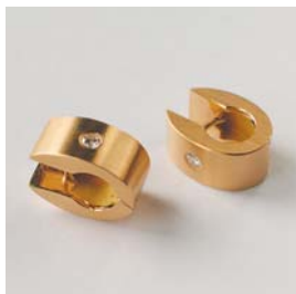
O-5032/1 Ohringe Gg 750 2 Brill. TWvs 0.11ct B: 6.8mm / L: 14.0mm