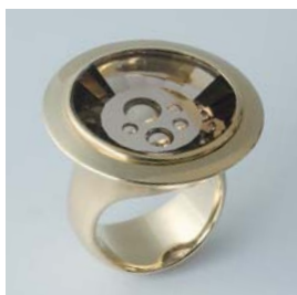
R-4433 Ring lightgold 375/- Rauchquarz 23.87ct