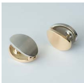
O-5433 Ohringe Pt 950/- + Gg 750/- B: 11.3mm / L: 17.1mm