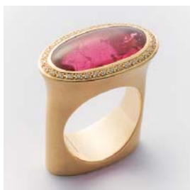
R-4347 Ring Gg 750/- Brill. TWvs Roter Turmalin