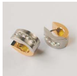
O-5131/5 Ohringe Pt 950 Gg 750 10 Brill. TWvs 0.45ct B: 6.4mm / L: 13.0mm