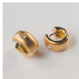
O-5352/1 Ohringe Gg 750 2 Brill. TWvs 0.10ct B: 6.5mm / Aø 11.8mm