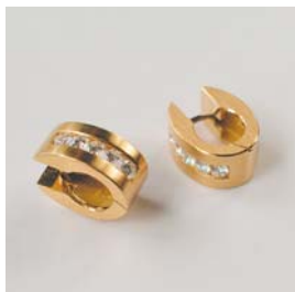
O-5130/5 Ohringe Gg 750 10 Brill. TWvs 0.45ct B: 6.3mm / L: 12.9mm