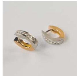
O-5055/7 Ohringe Pt 950 Gg 750 14 Brill. TWvs 0.20ct B: 3.0mm / L: 11.8mm