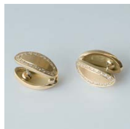
O-5434/20 Ohringe Gg 750/- 40 Brill. TWvs 0.34ct B: 8.7mm / L: 17.3mm