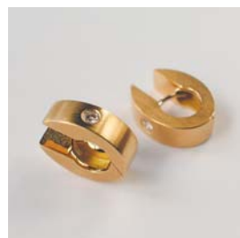
O-5064/1 Ohringe Gg 750 2 Brill. TWvs 0.10ct B: 4.8mm / L: 14.2mm