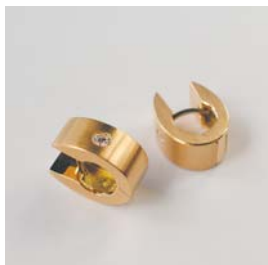
O-5030/1 Ohringe Gg 750 2 Brill. TWvs 0.08ct B: 5.8mm / L: 12.5mm