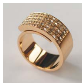
R-4282/50 Spiralring Gg 750 50 Brill. TWvs 0.65ct B: 9.8mm