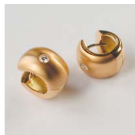
O-5350/1 Ohringe Gg 750 2 Brill. TWvs 0.12ct B: 8.5mm / Aø 12.4mm