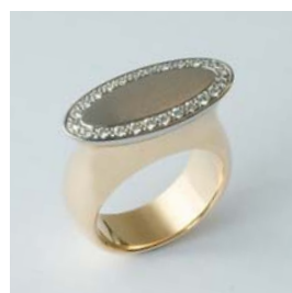
R-4450/24 Ring Gg 750/- + Pt 950/- 24 Brill. TWvs 0.29ct