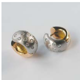
O-5291/12 Ohrringe Pt 950 Gg 750 24 Brill. TWvs 0.22ct B: 6.7mm / Aø 13.0mm