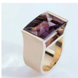
R-4312 Ring Gelbgold 750 1 Amethyst ca. 14-15ct.