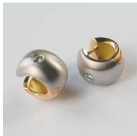
O-5351/1 Ohrringe Pt 950 Gg 750 2 Brill. TWvs 0.12ct B: 8.5mm / Aø 12.4mm