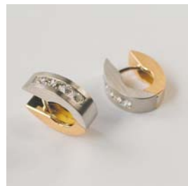
O-5157/5 Ohringe Pt 950 Gg 750 10 Brill. TWvs 0.40ct B: 4.5mm / L: 14.5mm