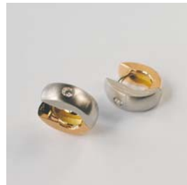
O-5249/1 Ohringe Pt 950 Gg 750 2 Brill. TWvs 0.07ct B: 4.3mm / L: 11.6mm