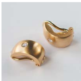
O-5254/1 Ohrclipse Gg 750 2 Brill. TWvs 0.11ct B: 7.0mm / L: 13.8mm