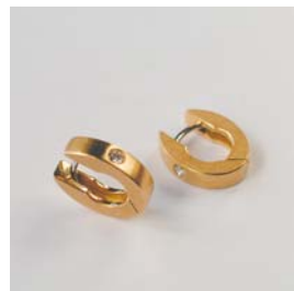
O-5060/1 Ohringe Gg 750 2 Brill. TWvs 0.07ct B: 3.0mm / L: 11.8mm