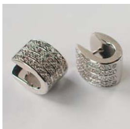
O-5296/28W Ohringe Wg 750 56 Brill. TWvs 0.84ct B: 9.0mm / L: 12.0mm