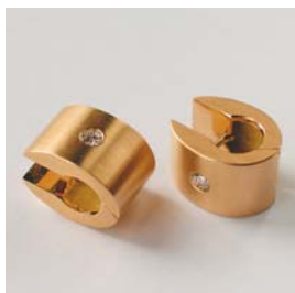
O-5034/1 Ohringe Gg 750 2 Brill. TWvs 0.14ct B: 10.0mm / L: 14.0mm