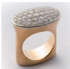
R-4409/39 Ring Gg 750/- + Pt 950/- 39 Brill. TWvs 1.77ct