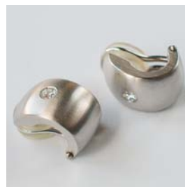
O-5253/1 Ohrclipse Pt 950 Bügel Wg 750 2 Brill. TWvs 0.13ct B: 9.0mm / L: 14.0mm