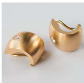
O-5288/1 Ohrclipse Gg 750 2 Brill. TWvs 0.24ct B: 11.0mm / L: 16.0mm