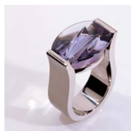
R-4313 Ring Graugold 750 1 Amethyst ca. 9-10ct.