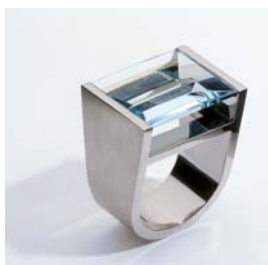
R-4316 Ring Graugold 750 1 Aquamarin ca. 14-15ct.