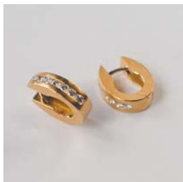
O-5056/7 Ohringe Gg 750 14 Brill. TWvs 0.28ct B: 3.7mm / L: 13.0mm