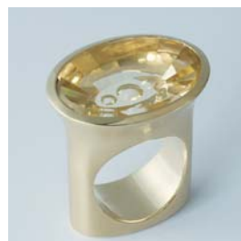
R-4346 Ring lightgold 375/- Citrin 23.16ct