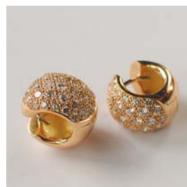
O-5292/29 Ohringe Gg 750 58 Brill. TWvs 1.27ct B: 9.0mm / Aø: 13.5mm