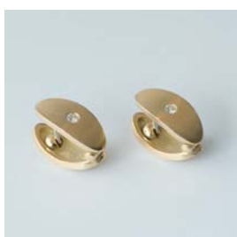
O-5434/1 Ohringe Gg 750/- 2 Brill. TWvs 0.12ct B: 8.7mm / L: 17.3mm