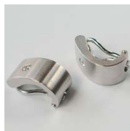
O-5342/1 Ohrclipse Wg 750 2 Brill. TWvs 0.11ct B: 8.0mm / L: 15.0mm