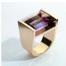
R-4316 Ring Gelbgold 750 1 Amethyst ca. 14-15ct.