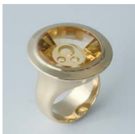
R-4434 Ring lightgold 375/- Citrin 17.48ct