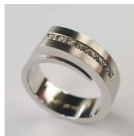
R-4284/10Pt Spiralingring Pt 950 10 Brill. TWvs 0.15ct B: 6.6mm