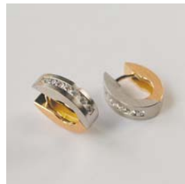
O-5057/7 Ohringe Pt 950 Gg 750 14 Brill. TWvs 0.28ct B: 3.9mm / L: 13.4mm