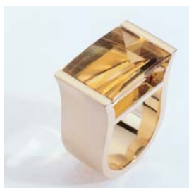
R-4312 Ring Gelbgold 750 1 Citrin ca. 14-15ct.