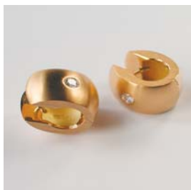
O-5210/1 Ohringe Gg 750 2 Brill. TWvs 0.13ct B: 8.7mm / L: 13.6mm