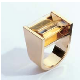
R-4316 Ring Gelbgold 750 1 Citrin ca. 14-15ct.