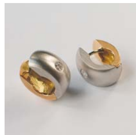
O-5213/1 Ohringe Pt 950 Gg 750 2 Brill. TWvs 0.11ct B: 6.8mm / L: 13.3mm