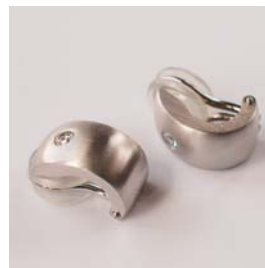
O-5255/1 Ohrclipse Pt 950 Bügel Wg 750 2 Brill. TWvs 0.11ct B: 7.0mm / L: 13.8mm